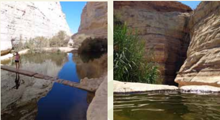
Ein Avdat national Park

Follow the road to the canyon or find the red markers on the right for the short-cut. Walk along the road towards the inner parking lot. Last chance for a toilet for the next 1:30 hours. You are asked to refrain from eating in the reserve or going to the bathroom in nature. Follow the blue markers into the canyon, past the old Pistacia tree and to the first waterfall. Climb the stairs on the right wall of the canyon and follow the markers to the grove of Poplars at the upper end. The trail follows a series of stairs until it reaches two ladders attached to the canyon wall. Once you make it to the top, follow the cliff to the left (south), with blue markers, until you reach the overlook of EIN MAARIF. Continue south along the dry creek. Look out for the rock drawings on the west bank. In the winter, waterholes filled with rain water make for an amazing addition to this section of the hike. Finish at the gas station under the Ruins of Avdat- a Nabatian city visible on the hill to the west.