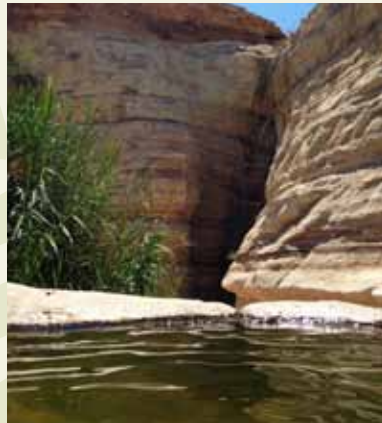
Ein Akev spring